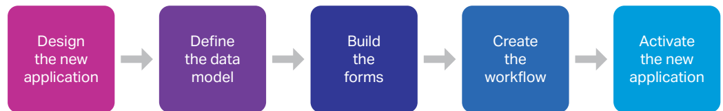
Figure 1. Five simple steps for creating an application with SMAX

Creating a new process-based application in SMAX is entirely codeless and easy to do. Figure 1 illustrates the five steps for creating the user-defined security vulnerability application from our example.